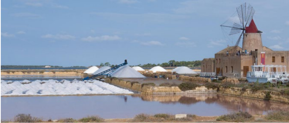
Trapani salt pans

Alghieri and a delicious gelato before heading back to Palermo, reflecting on a day rich with Sicily's coastal beauty, historic charm, and culinary delights.