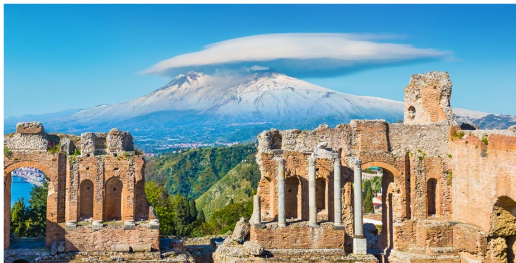
Taormina and Mt. Etna

After your volcano tour, visit the Barone di Villagrande Winery on the slopes of Etna. Enjoy a tour of the vineyard and wine cellars, followed by a tasting of their exquisite wines. Pair your wine tasting with a delicious lunch featuring local produce, all while taking in the stunning views of the surrounding vineyards and the volcano.